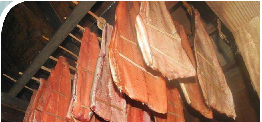
Traditionally smoking dog salmon, Robert Joseph's smokehouse, 2014