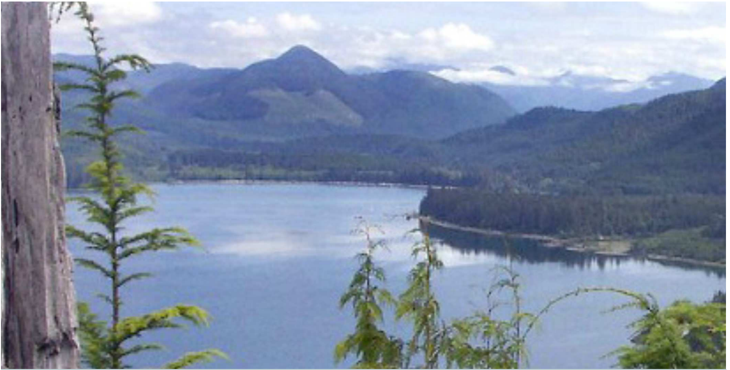
North end of Nitinaht Lake, 2015