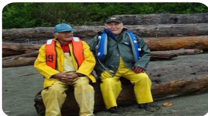
Photos submitted by : Ditidaht Heritage Researchers on the Groundtruthing trip.