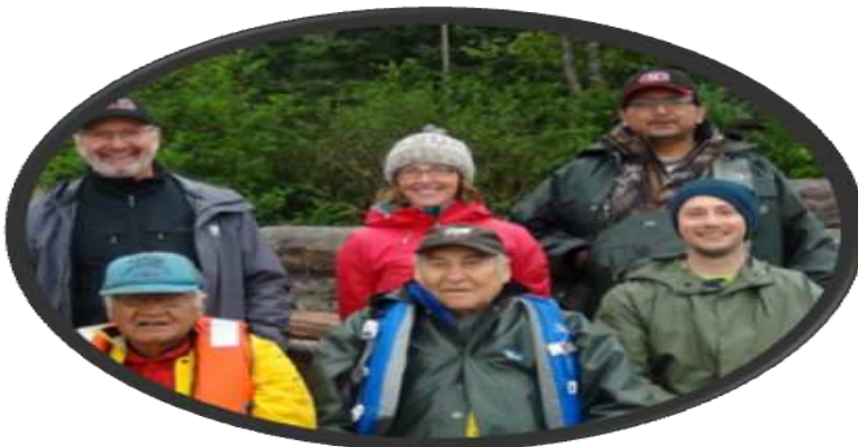
Photo submitted by: Ditidaht Heritage Researchers on the Groundtruthing trip